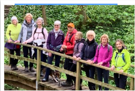
Group photo as we pass through the woods.