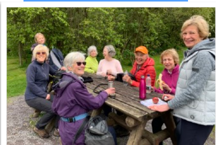
A quick break to rehydrate.

The walking group meet regularly and last month the walk attracted 9 members. Some regular and some who had not been for some time (mentioning no names!).