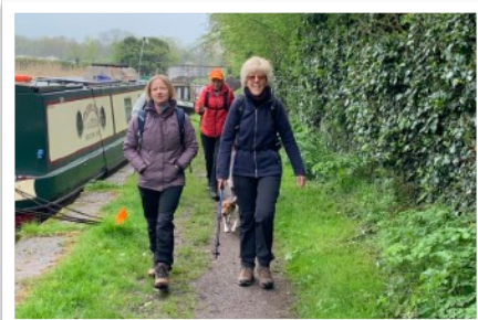
A gentle start along the tow path.